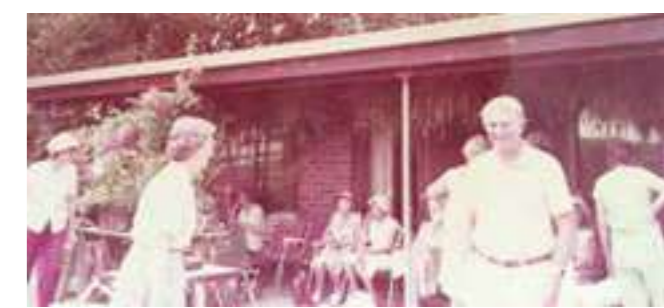
Nambour Garden Club's first meeting was held in 1979.

Meetings progressed from being held in many beautiful gardens and parks, to the Uniting Church Hall where the large vibrant Club now meets. Some of the inaugural members are still members to this