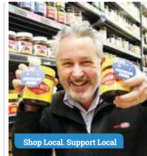
Shop Local. Support Local