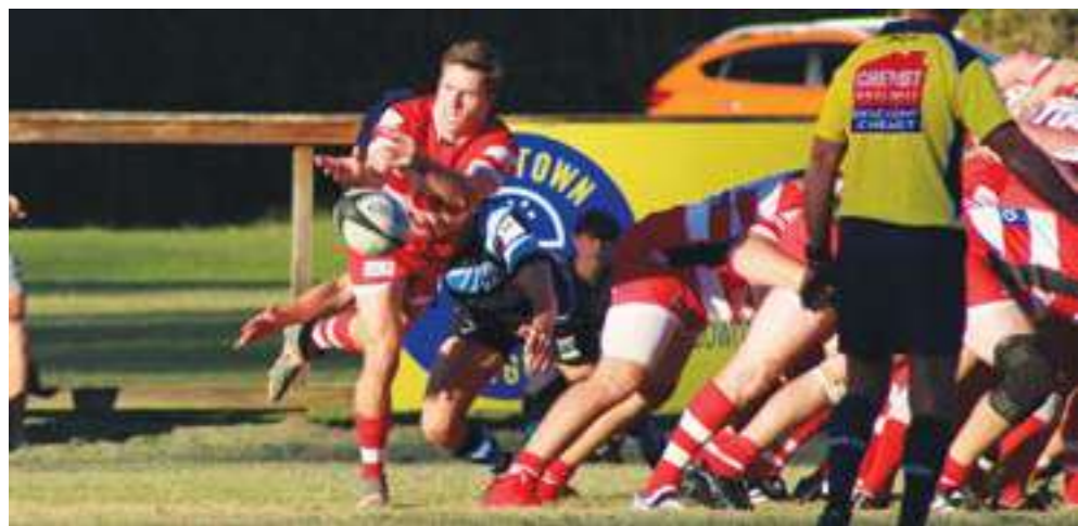
Some of the action from last Saturday's seniors match at Nambour's home ground.