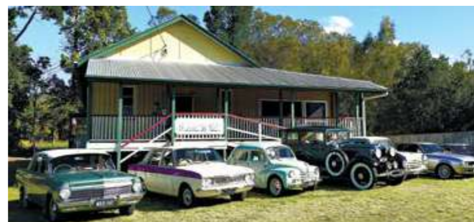
The Maroochy Vehicle Owners Club Inc, who manage the hall and are organising the event, invite the public to the afternoon of friendship and reminiscence.

• Nambour Newsagency and Casket Agency, Shop 28, 52-54 Currie Street, Nambour. Phone 5441 2029.