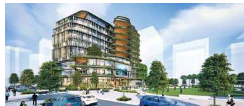
The $59.6 million City Hall building will be completed in 2022 but will pull much-needed permanent Council employees from Nambour.

Call 07 5445 7044 or visit www.rangecare.com.au/frozen-meals