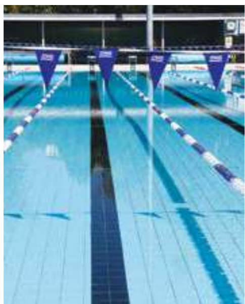
Nambour Aquatic Centre is one of the venues to receive upgrades thanks to $5.35m in funds.

In announcing the projects, Local Government Minister Stirling Hinchliffe said the positive impacts would be felt almost immediately, supporting local businesses and jobs.