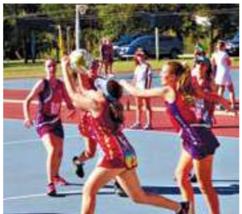
Palmwoods Stingers and Chevallum Cyclones go head to head in their return to netball game.