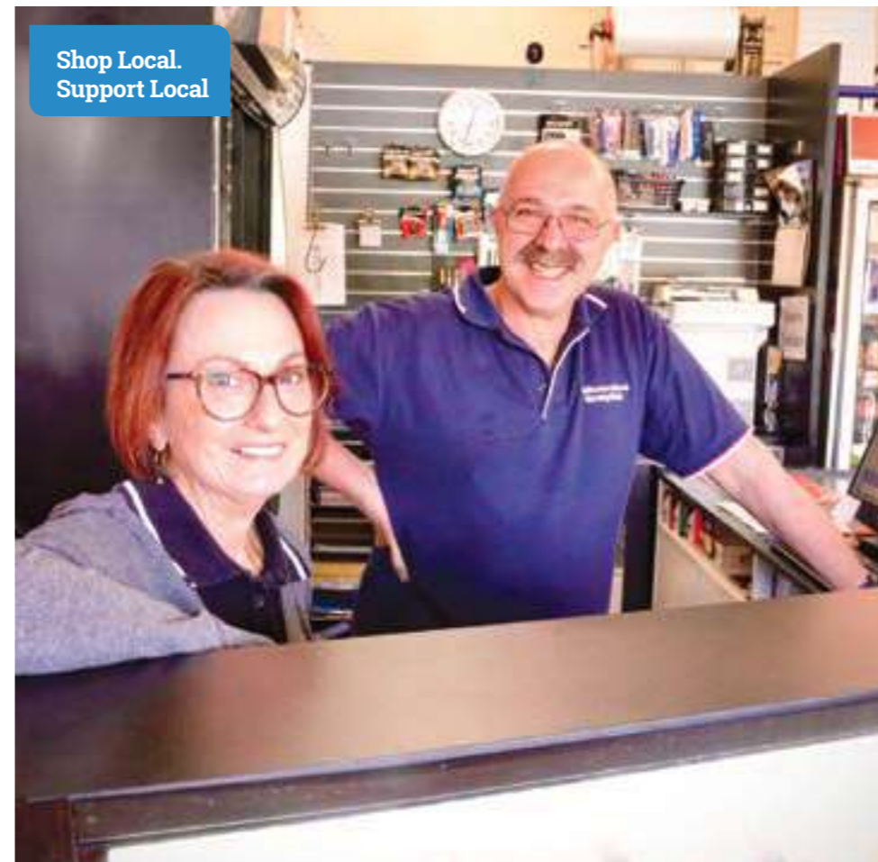
Shop Local. Support Local