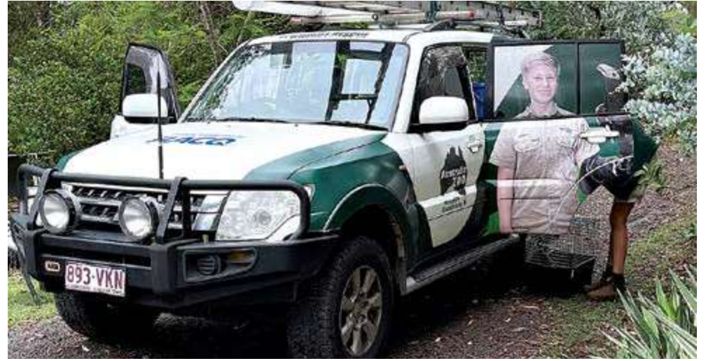
The Australia Zoo Rescue Team vehicle arrives emblazoned with Robert Irwin's image.