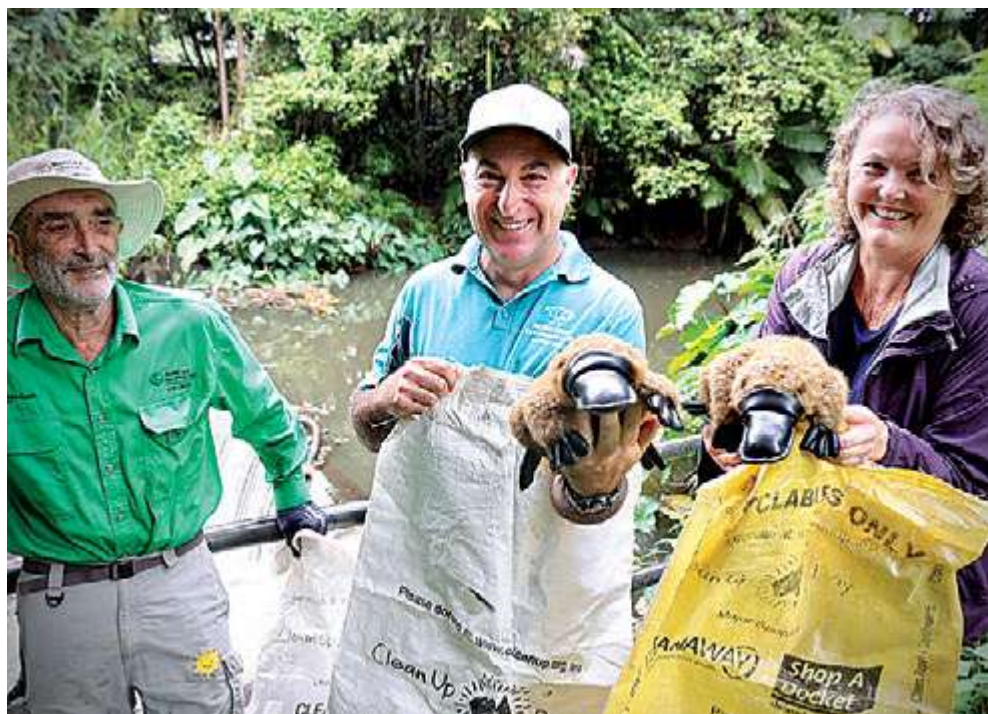
Everyone is invited to help clean up Petrie Creek for the resident platypuses. See videos of platypuses in Petrie Creek on Facebook @PetrieCreekCatchmentCareGroupInc