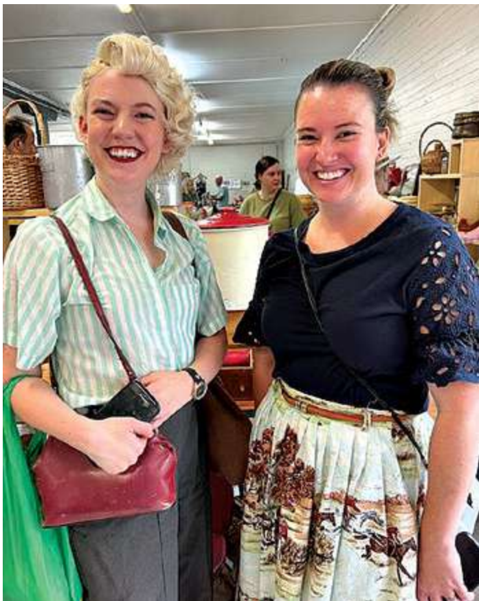
Collectorama provides a unique way to express your individuality.