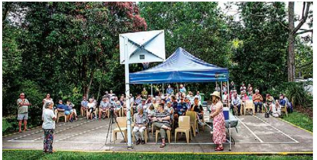
The Crowd in Ash Park for Diddillibah Book launch.

► To become a Wishlist volunteer go to wishlist.org.au/get-involved/volunteer/