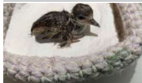
A masked lapwing undergoes the Sunday weigh-in.

My office is offering a FREE grant writing session to local community organisations wanting to apply for Round 113 of the GCBF on the 26th of February in Nambour. Head to bit.ly/NicklinGrants to find out more.