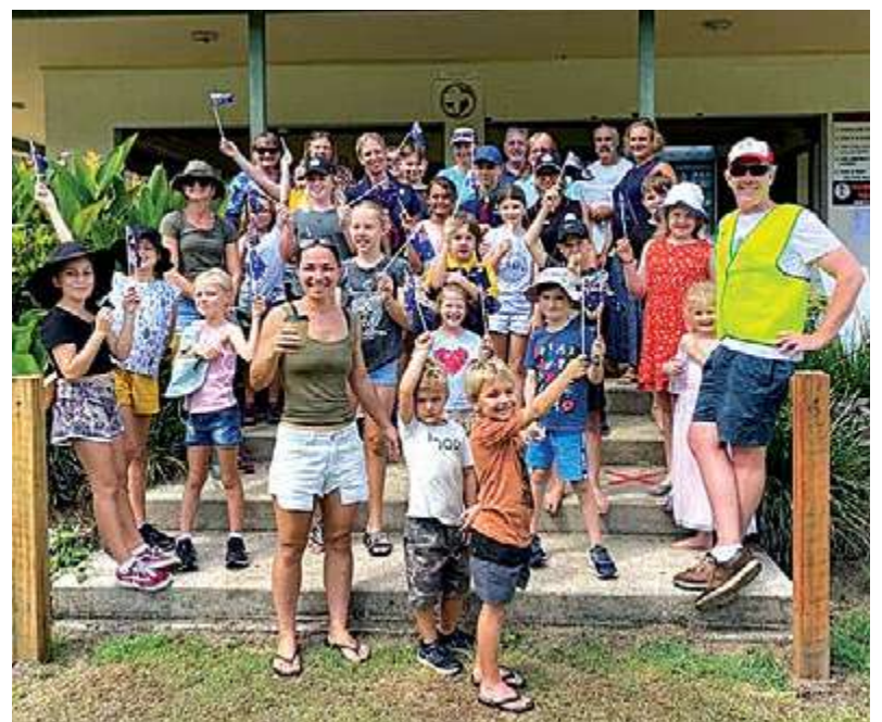
Volunteers enjoyed last year's event.