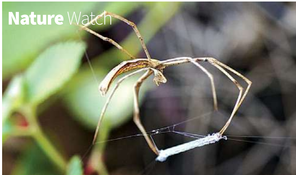
The net is dropped onto prey – even an insect in flight.