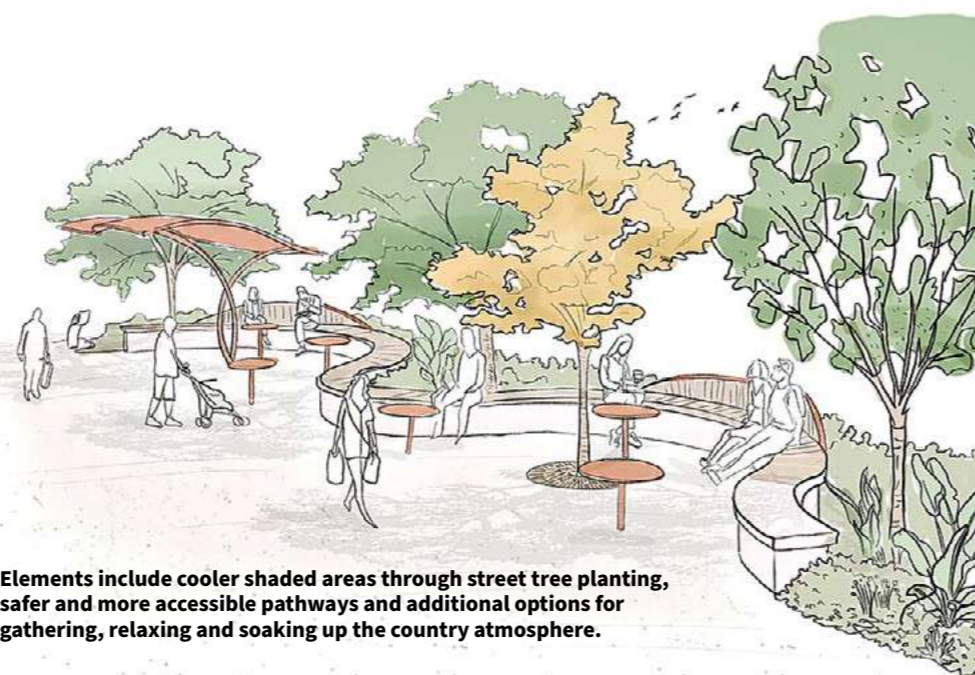
Elements include cooler shaded areas through street tree planting, safer and more accessible pathways and additional options for gathering, relaxing and soaking up the country atmosphere.

"We do this for our future, and for future generations."