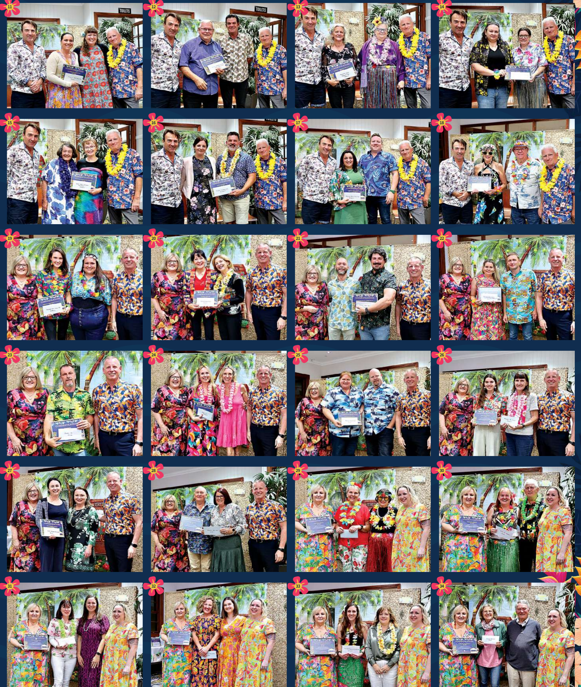
13. Mooloolah Valley Community Assoc $4,600 14. Nambour Special School P & C $3,735 15. Petrie Creek Catchment Care Group Inc $2,500 16. Suncoast Hinterland BMX $2,565 17. Mooloolah Primary School P & C $1,124 18. Little Village Choir Christmas Concert Committee $10,000 19. Palmwoods State School P & C $2,500 20. Montville Tennis Club $1,343 21. Palmwoods Warriors Football Club Inc $12,457 22. Palmwoods & Western District Junior Rugby League Football Club (Devils) $3,853 23. Compass $5,000 24. Calmer Kids $2,000 25. Palmwoods Cricket Club Inc $15,000 26. Palmwoods Girl Guides $3,985 27. Daniel Morcombe Foundation $4,000 28. Palmwoods Bowls Club $9,150 29. Little Village Choir Inc $2,500 30. Giving Kids Memories $4,000 31. Palmwoods State School $3,388 32. Cittamani Hospice Service $6,000 33. The Range Community Kindergarten Assoc $4,600 34. Palmwoods Tennis Club Inc $8,000