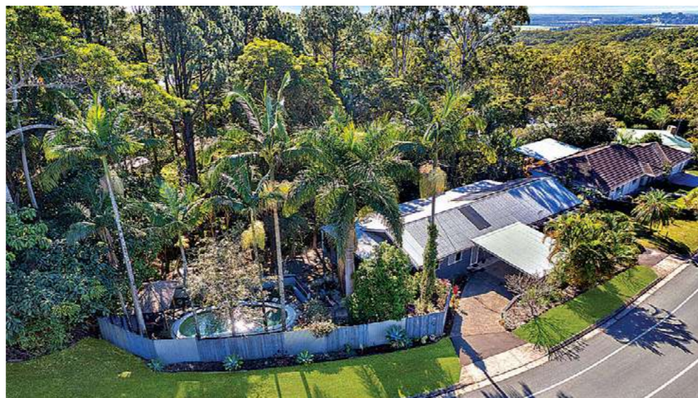
The 1280m2 block offers possibilities for landscaping, gardening and even future expansion.