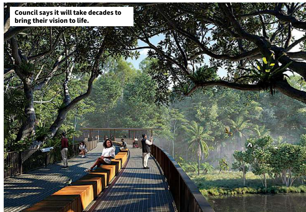
Council says it will take decades to bring their vision to life.